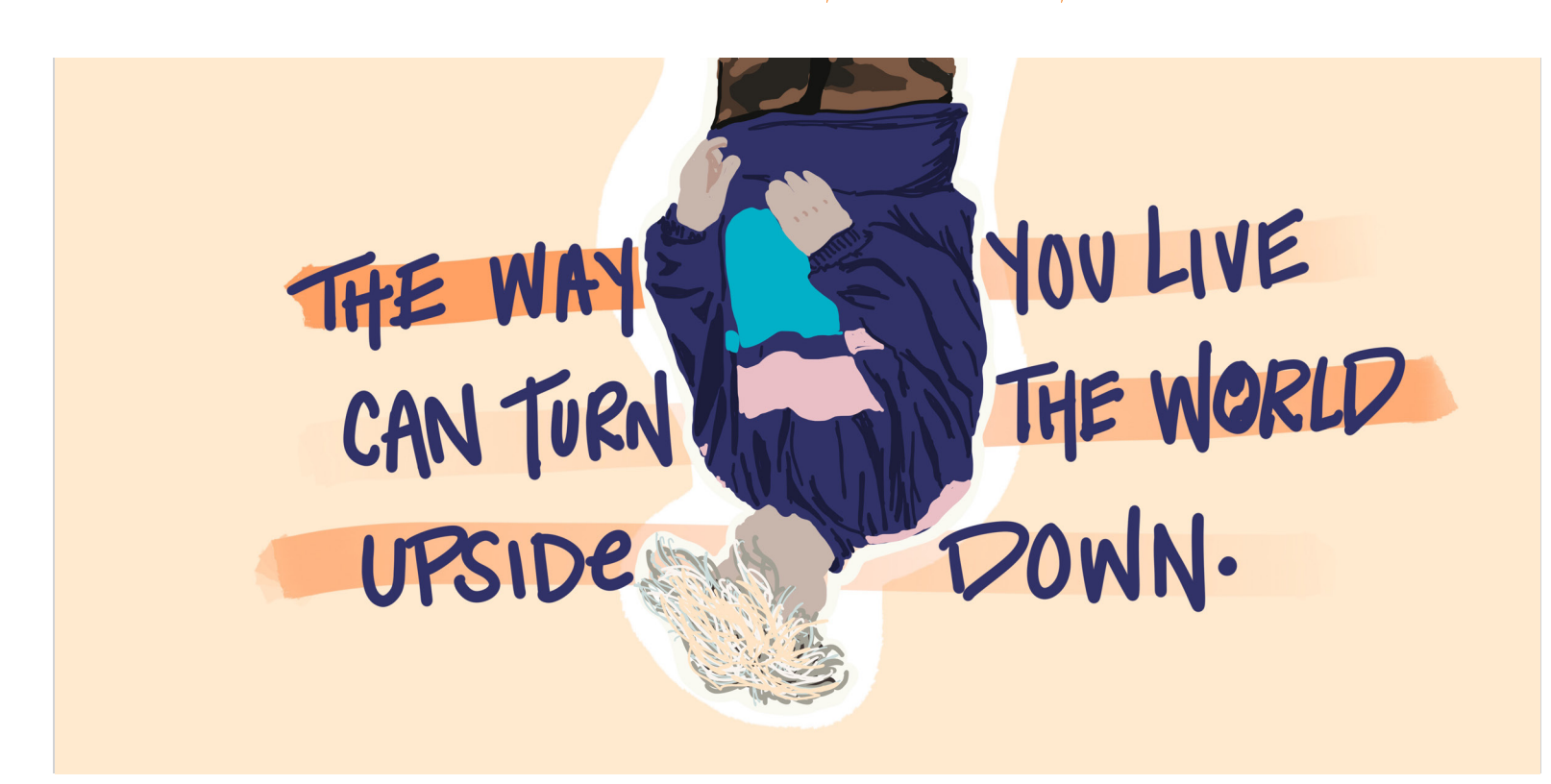
THE UPSIDE DOWN KINGDOM | A SERIES ABOUT AUTHORITY