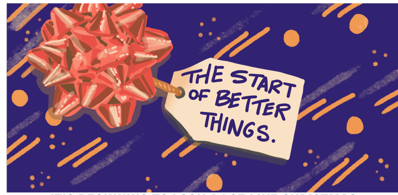
IT'S BEGINNING TO LOOK A LOT LIKE CHRISTMAS A SERIES ABOUT ADVENT