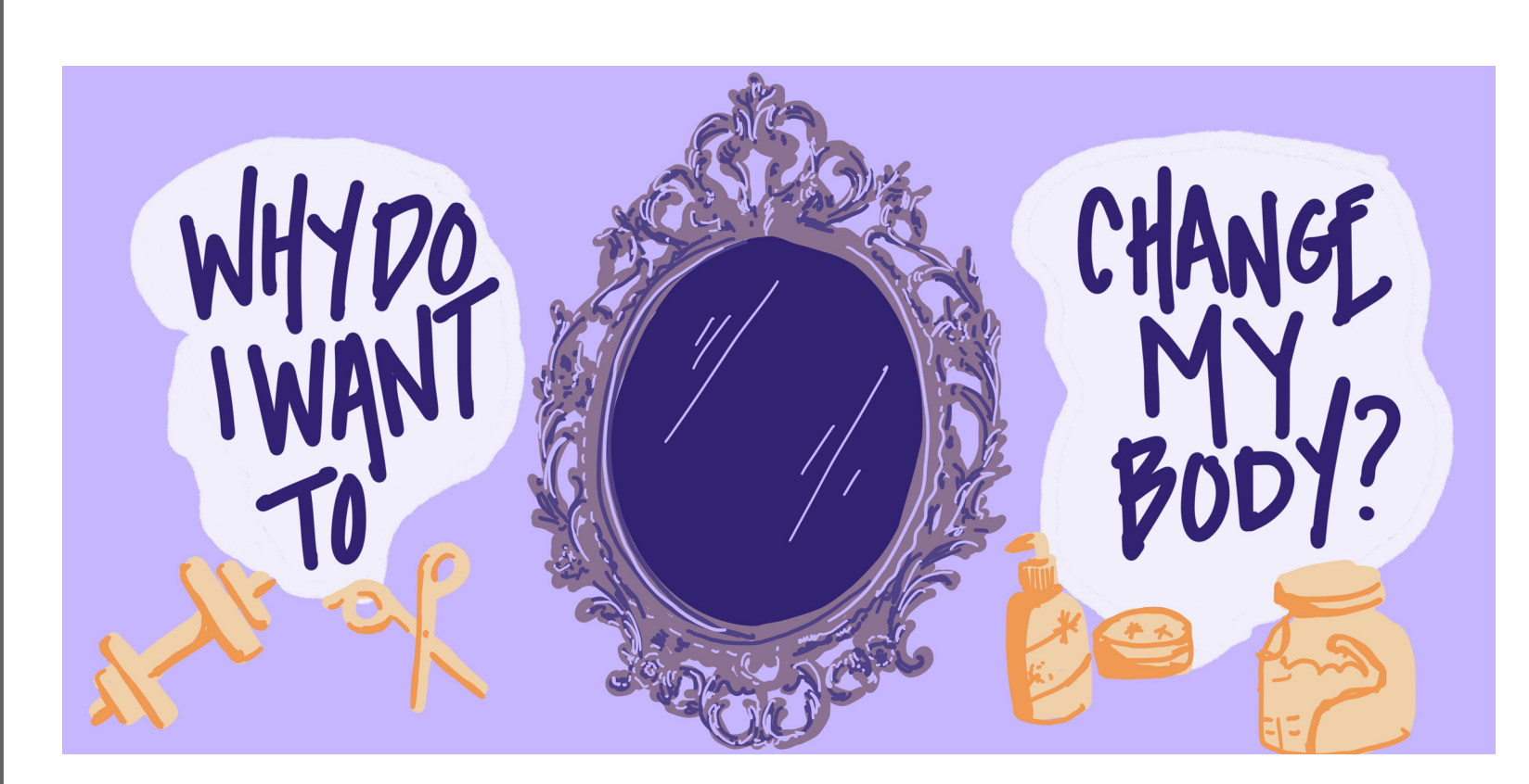
I HAVE QUESTIONS | A SERIES ABOUT BODY IMAGE