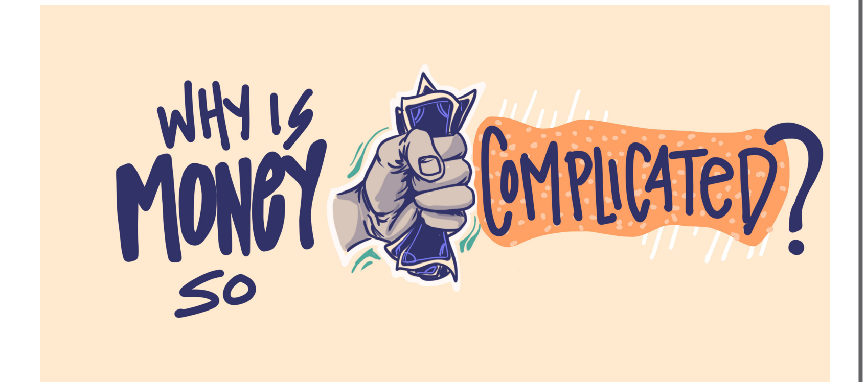
I HAVE QUESTIONS | A SERIES ABOUT MONEY