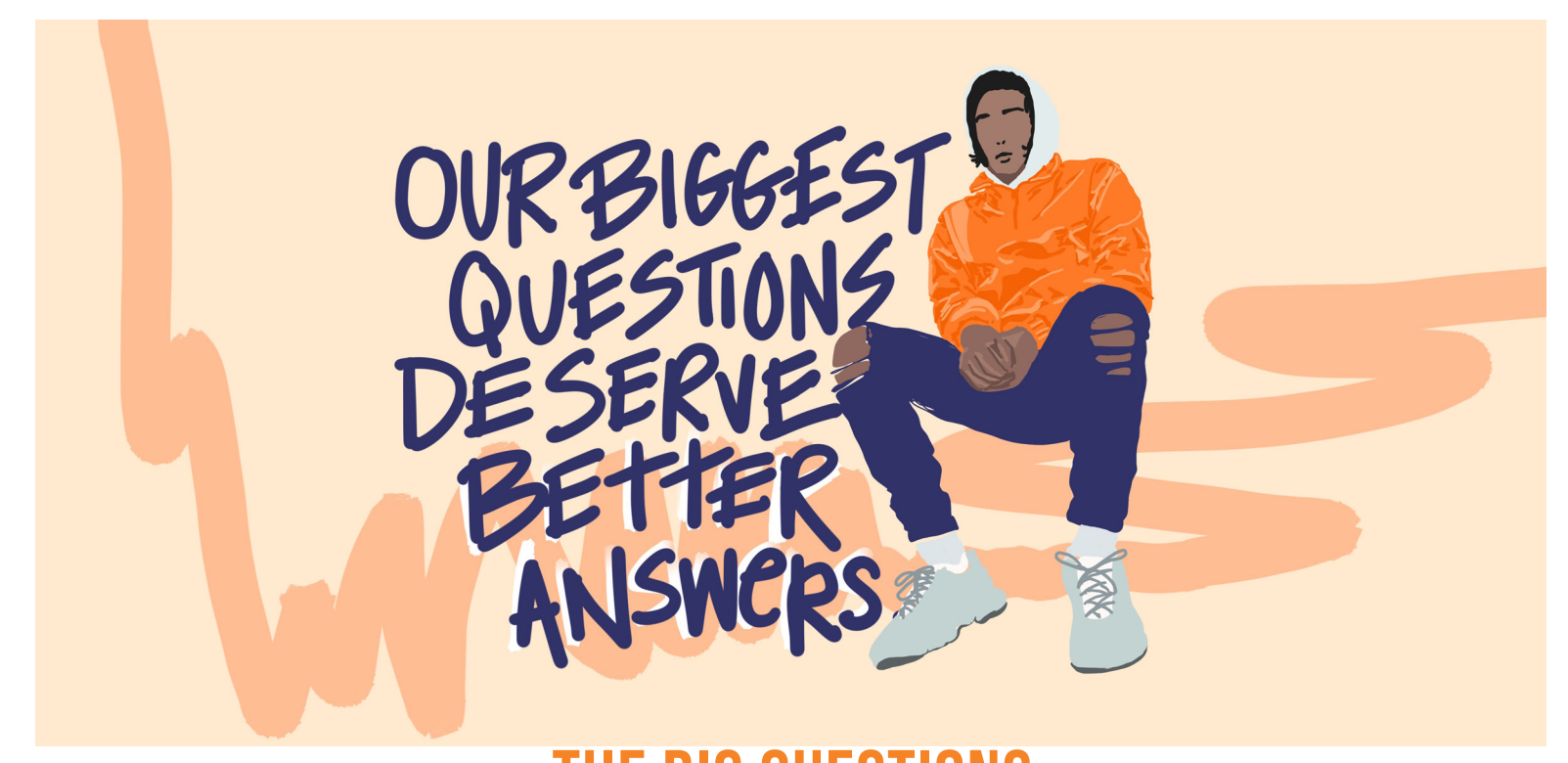
THE BIG QUESTIONS A SERIES ABOUT IDENTITY, PURPOSE, & BELONGING