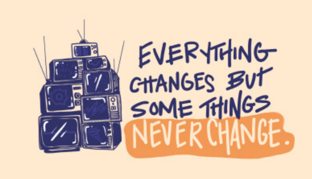
EVEN IF | A SERIES ABOUT CHANGE