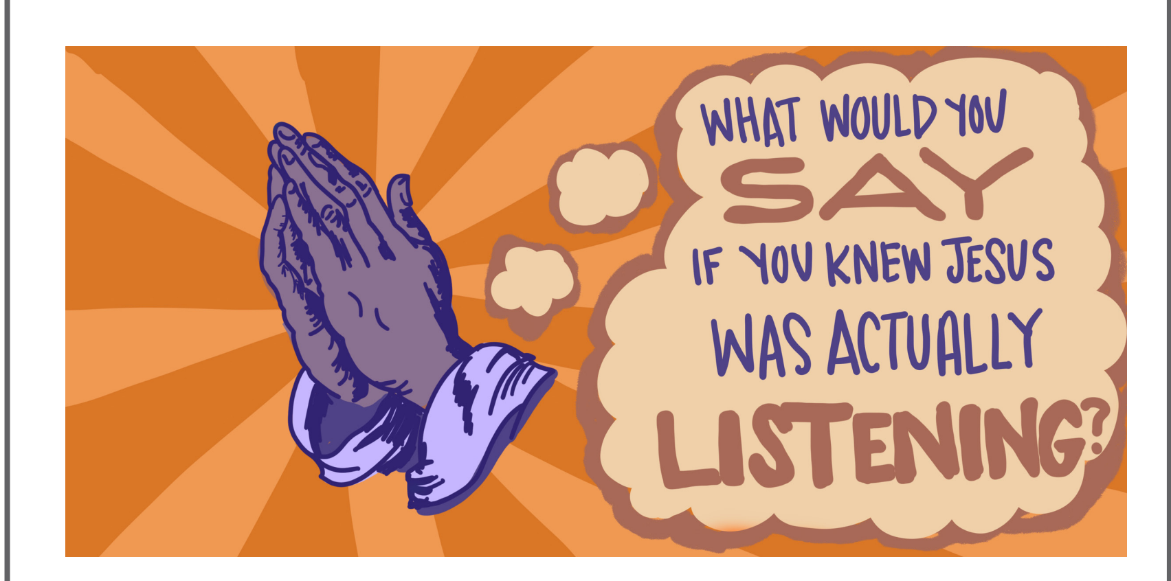
THOUGHTS AND PRAYERS | A SERIES ABOUT PRAYER