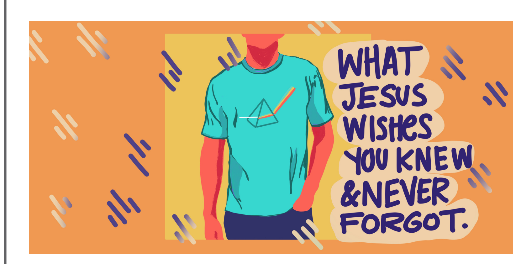
PRISM | A SERIES ABOUT EASTER