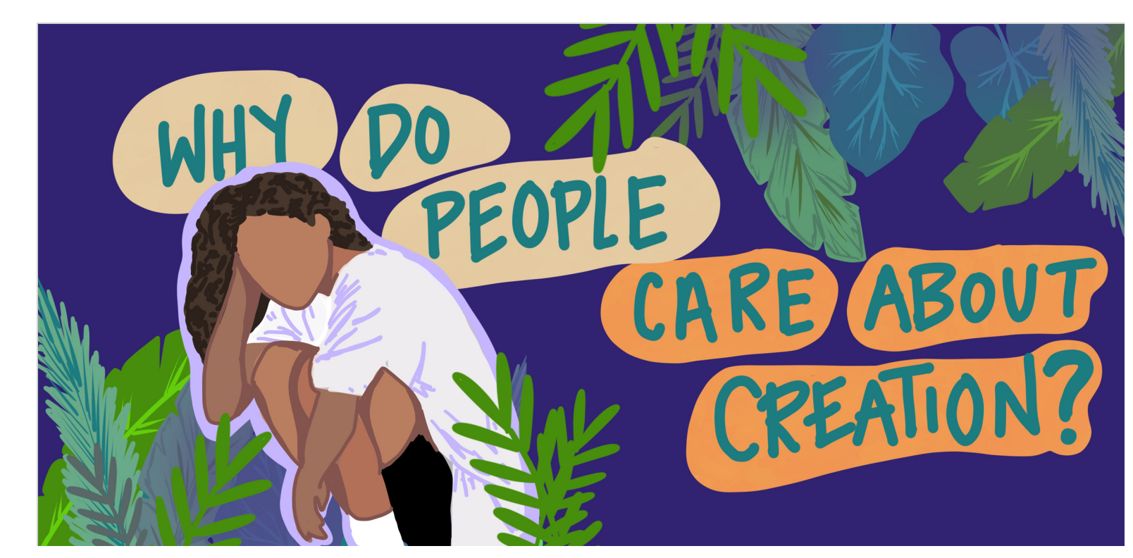
I HAVE QUESTIONS | A SERIES ABOUT CREATION