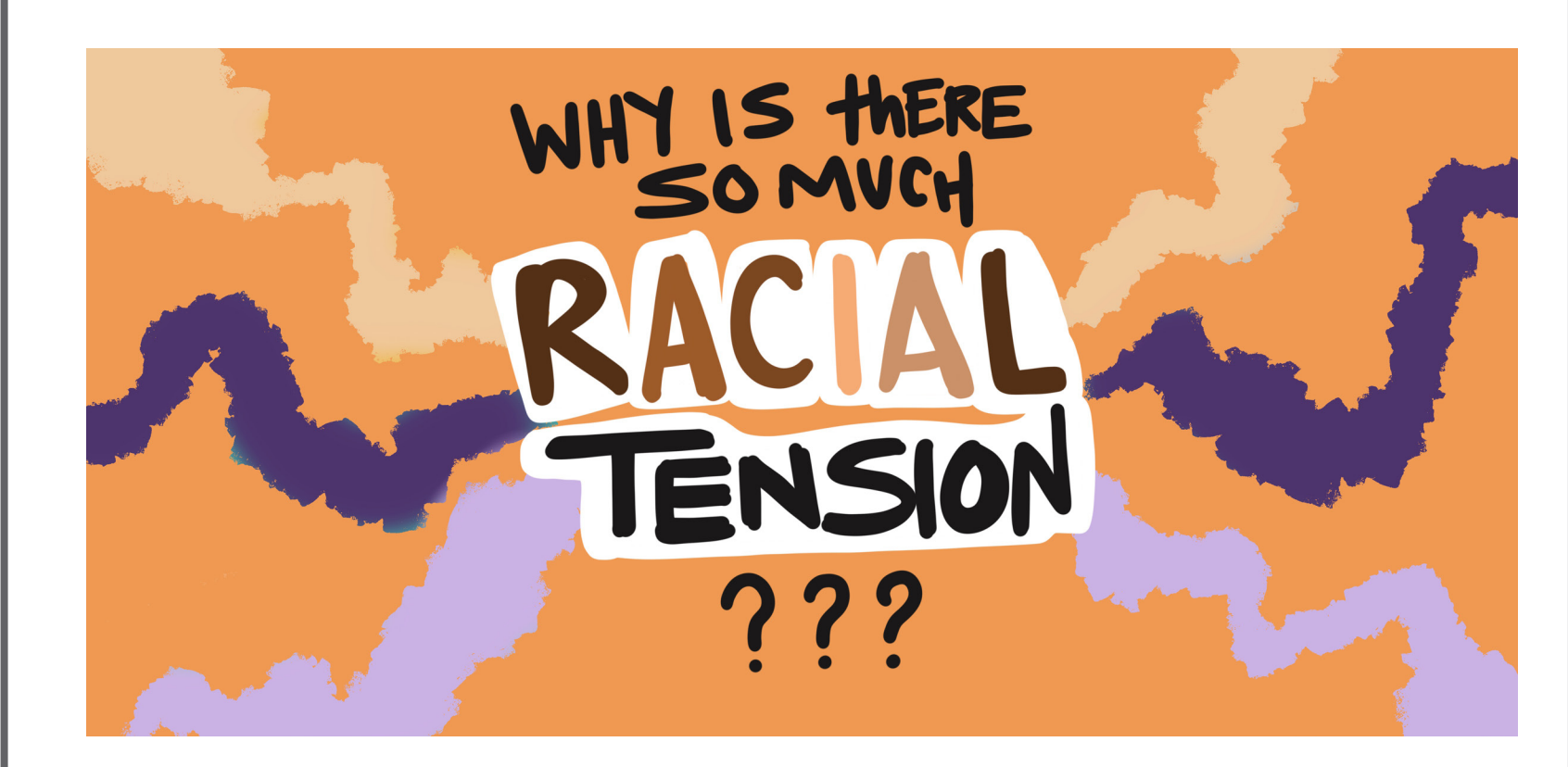
I HAVE QUESTIONS | A SERIES ABOUT RACIAL TENSION