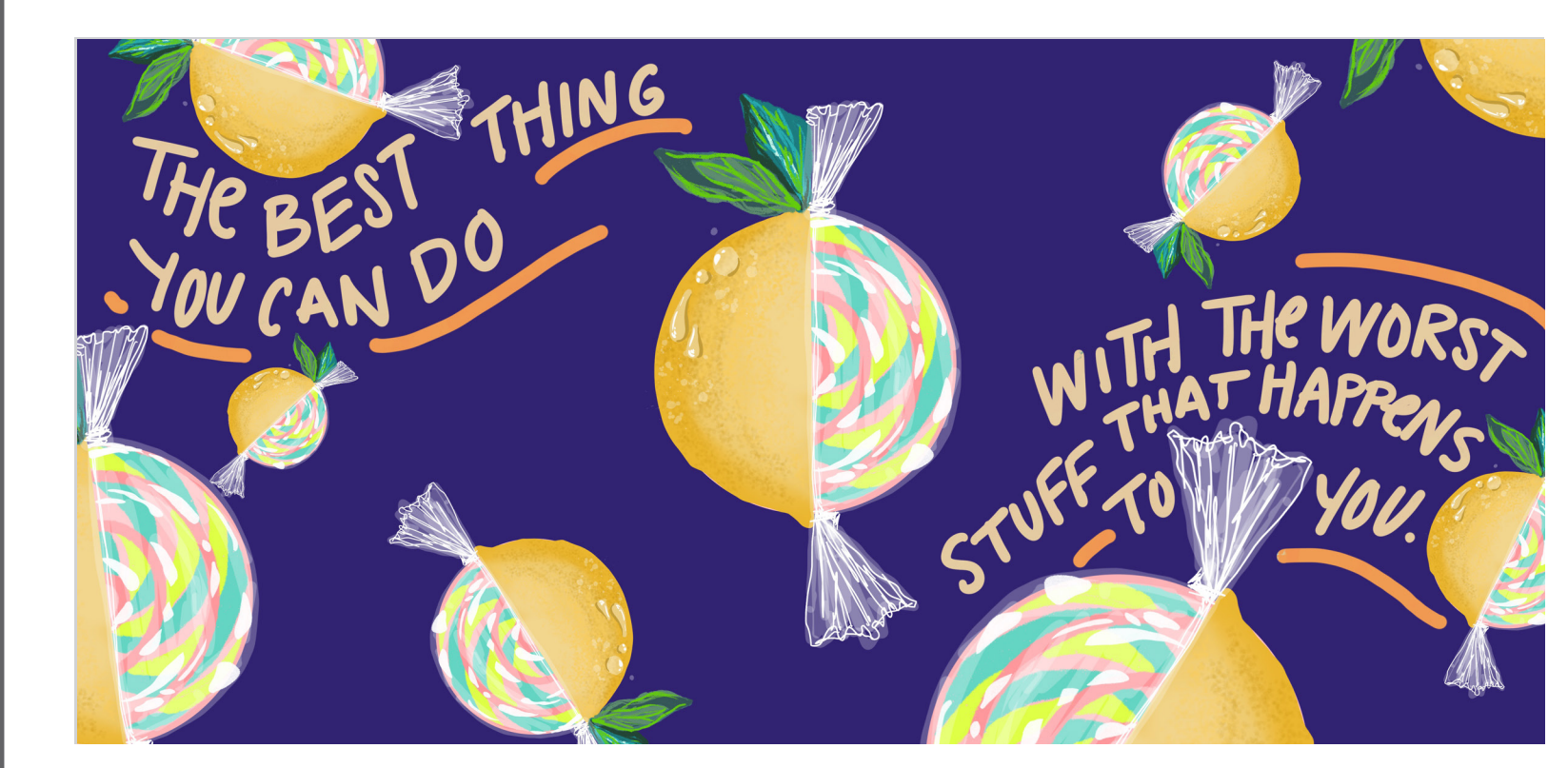
BITTERSWEET | A SERIES ABOUT FORGIVENESS