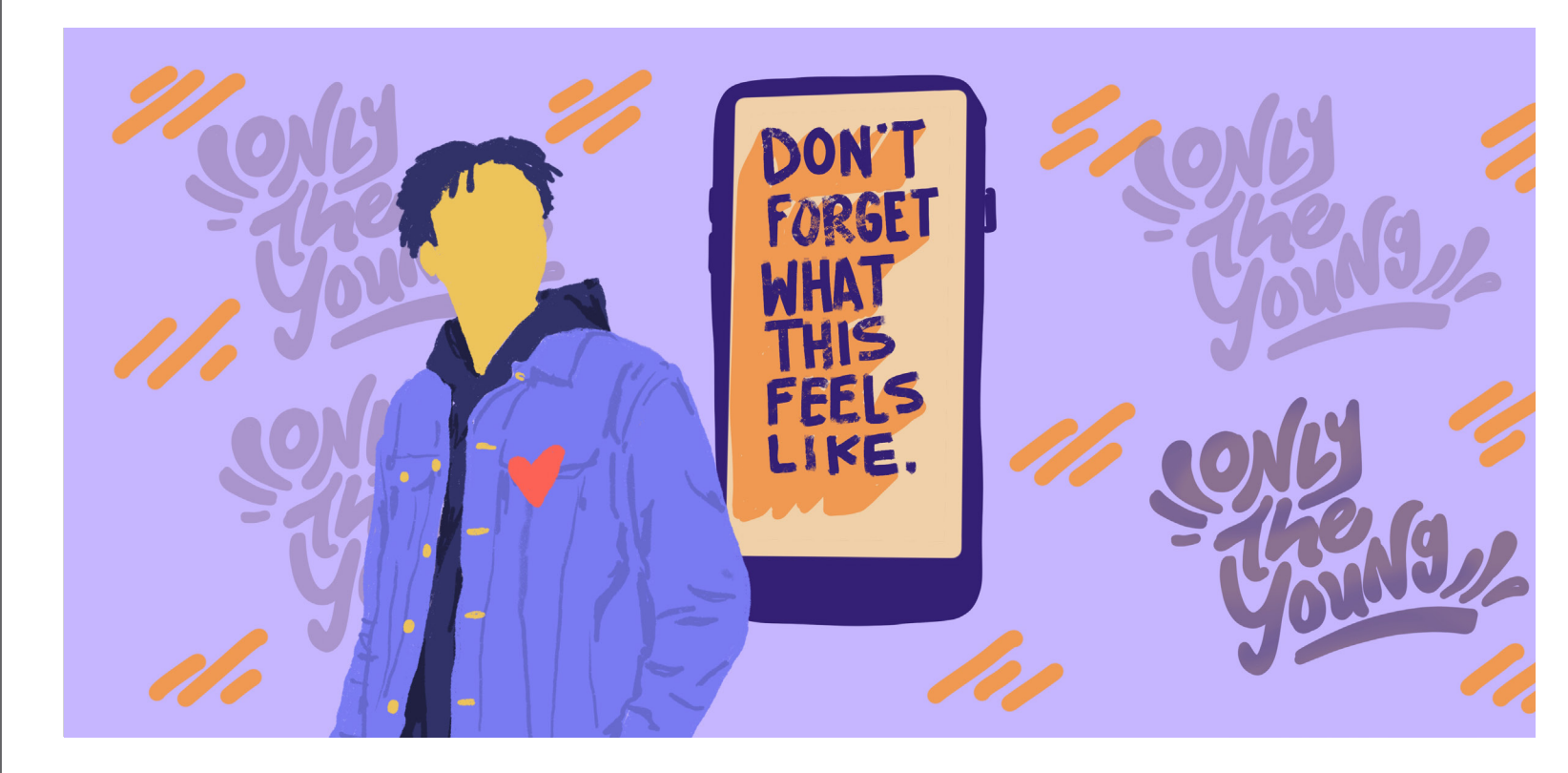
ONLY THE YOUNG | A SERIES ABOUT YOUTH